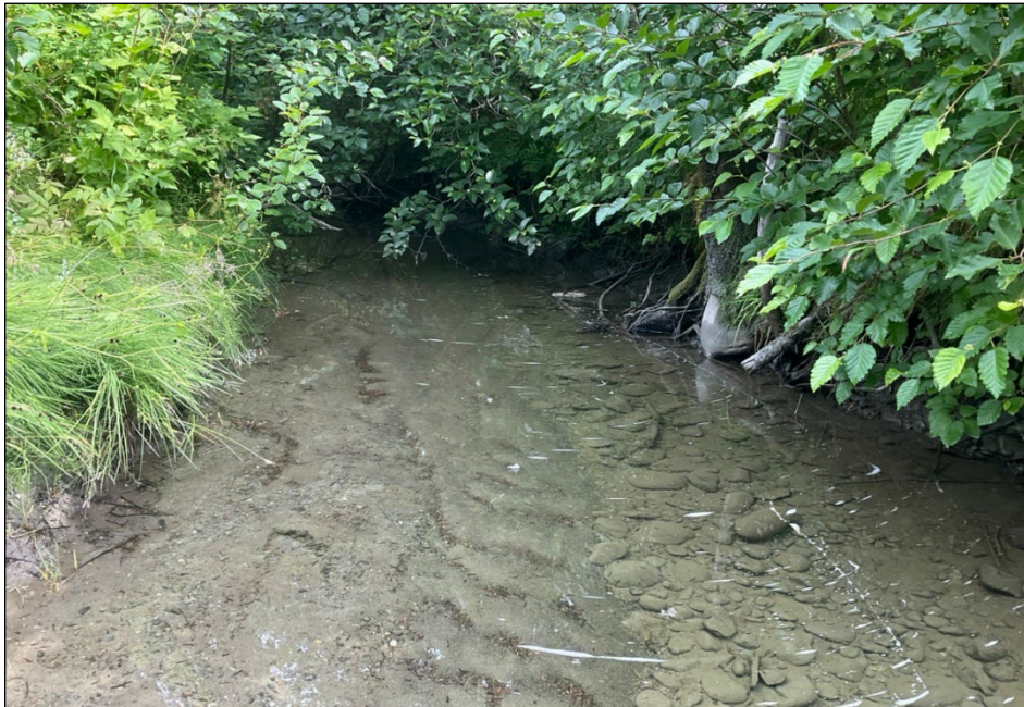
Figure 3.—Downstream at waypoint 671.