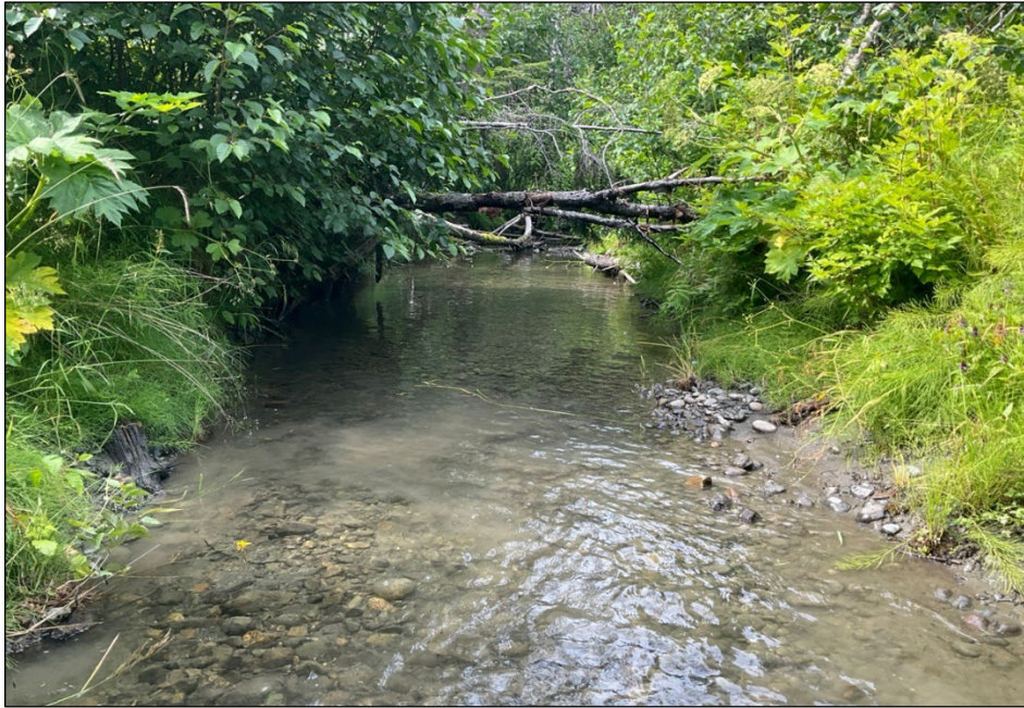
Figure 2.—Upstream at waypoint 671.