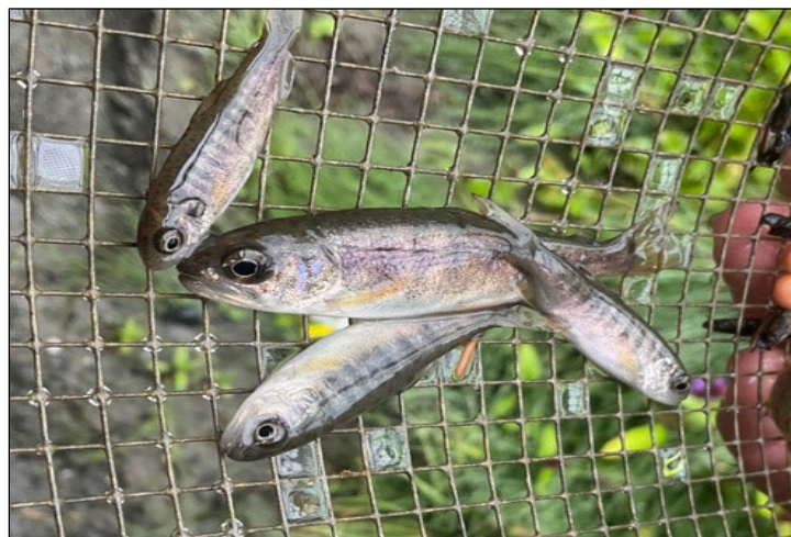
Figure 1.–Juvenile coho salmon caught at waypoint 671.